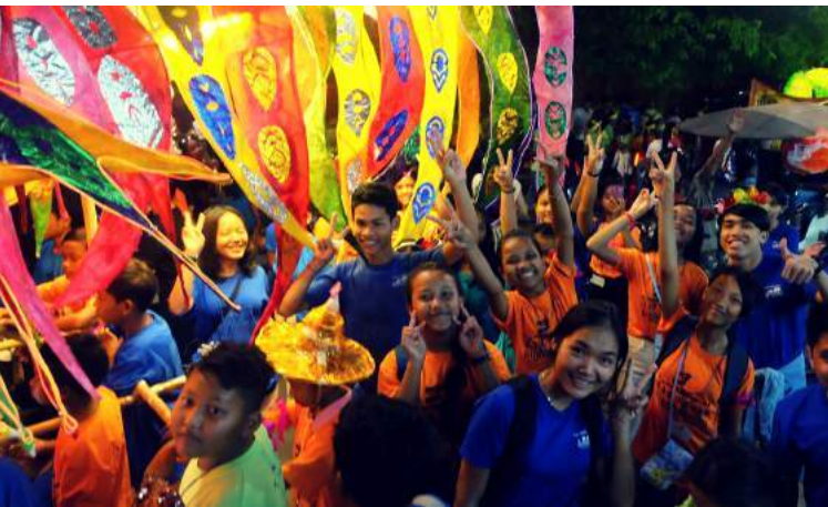
JWOC Puppet Parade!