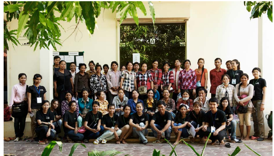
Borrowers and the Microfinance team during the March disbursement.

Achievement- We had 16 borrowers take a start-up loan and all were able to continue their business for the duration of the loan and make full repayments.