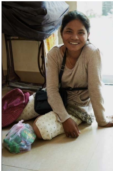
One of our happy start-up borrowers

Achievement- Through improvements in the system and a larger team we were able to distribute an additional 107 loans in 2012 compared to 2011. This increase did not have a detrimental effect on repayments which remained high.