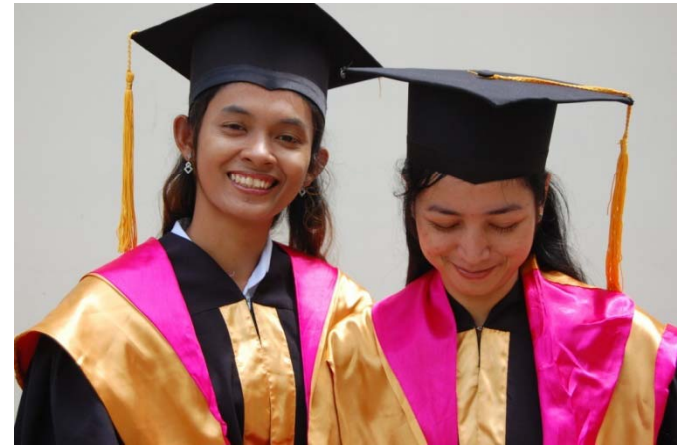
27 students graduated in Cambodia

To learn more about how the scholarship programme works take a look here .