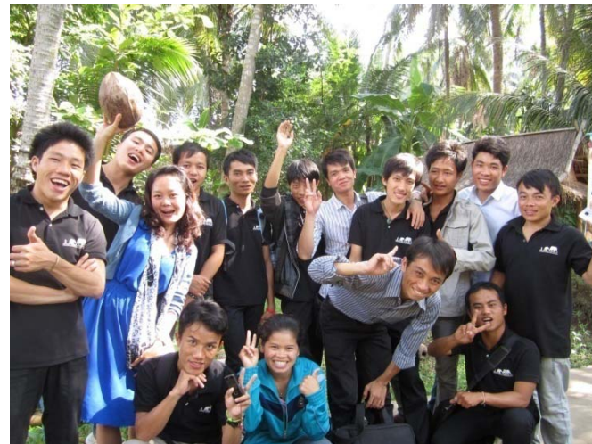
Laos students held a very fun reunion and team building day