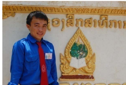
Photos L-R, Phik Noy Primary School, one of our scholarship students outside his college and a weekend craft lesson