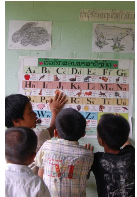
Donated resources in use in a local school classroom.

To see pictures from our work in Laos take a look here and here .