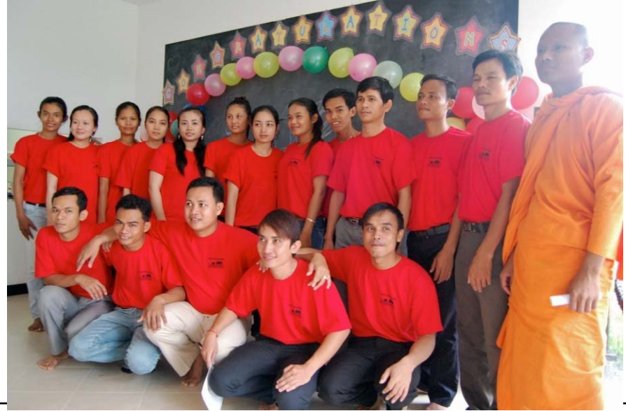
Our 2012 graduates pose at their celebratory party

Achievement -The average monthly salary of our graduates was $239, over three times the national average