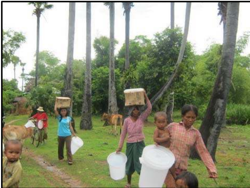
Women in Lbaeuk Village, Pouk District, return to their homes with their ceramic water filters after attending compulsory filter training delivered by JWOC's Scholarship Student Clean Water Officers.