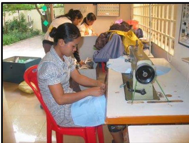
The vocational sewing classes had a great year with over forty students able to benefit from learning this new skill and further elements of the course introduced such as English for Sewing.