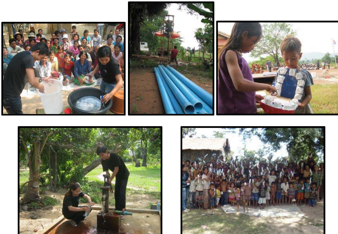
Some of the stages JWOC goes through in each partner village in Siem Reap Province including: ceramic filter training; well drilling; hygiene training; and water testing.

Less data is currently available on the Impact Assessments , conducted six months after the end of the project, but early results are encouraging. As the project goes into its second year and more results come in for this part of the survey process, JWOC will have a much better indication of the way the project is affecting the health of the villages JWOC has worked with.