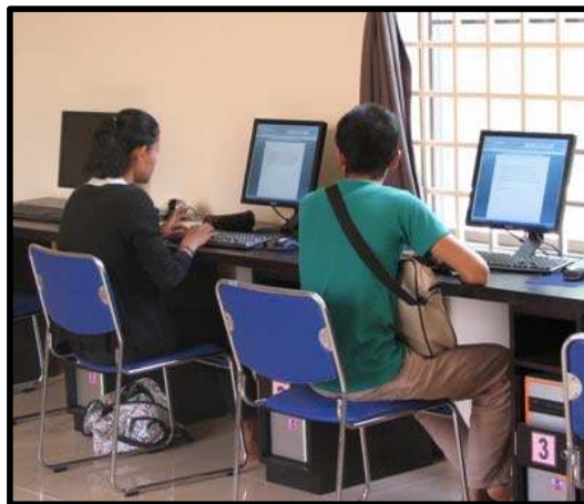
A wonderful new computer lab with twenty computers and a full time supervisor and teacher were made possible in 2010.

Finally, the JWOC library has also been a great addition to the educational opportunities JWOC can offer. In 2011, we hope to hire a librarian and set in motion a whole-range of educational activities throughout the day for students, young and old, to be able to benefit from this new space and its resources. In 2010 the library has already been in use by our new kindergarten class, art class and for various trainings and meetings.