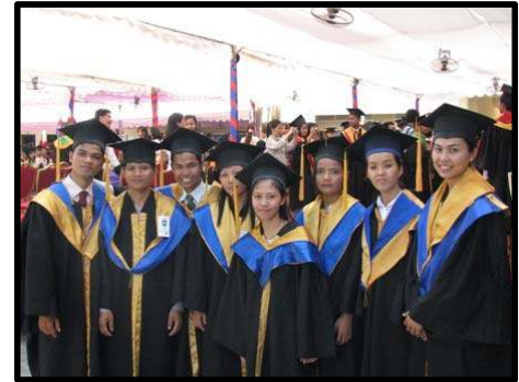
More than 30 JWOC scholarship students attended their official graduation ceremony at BBU in November

20 scholarship students completed their university degrees with JWOC in 2010.