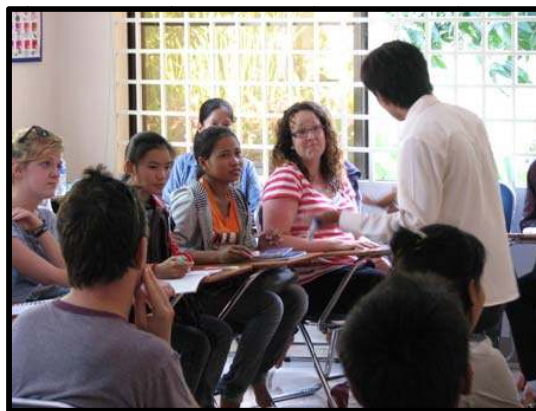
Volunteers from TravelAid in the UK get involved in a conversation class during their month long stay at JWOC in August.