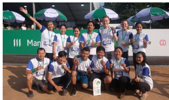
Our Marathon runners during the Race4Youth in December