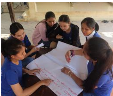
Students questioning "What does it mean to be a leader?"