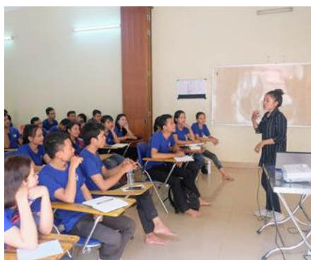
A workshop with the Reproductive Health Association of Cambodia