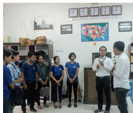
A tour of the American Corner at the University of South East Asia