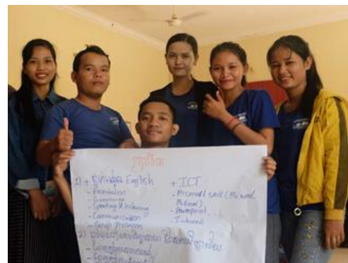
A brainstorming session about what new classes and workshops we should introduce for our students in 2020

Why focus on youth? Youth are the key to Cambodia's social and economic development. However, the Cambodian education system lacks resources and has insufficient skills training. We know that finishing High School and continuing on to University, vocational training or work will help young people develop the skills they need to better their future.