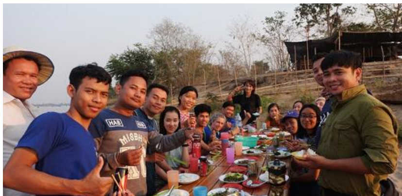
Staff team building events in March and August