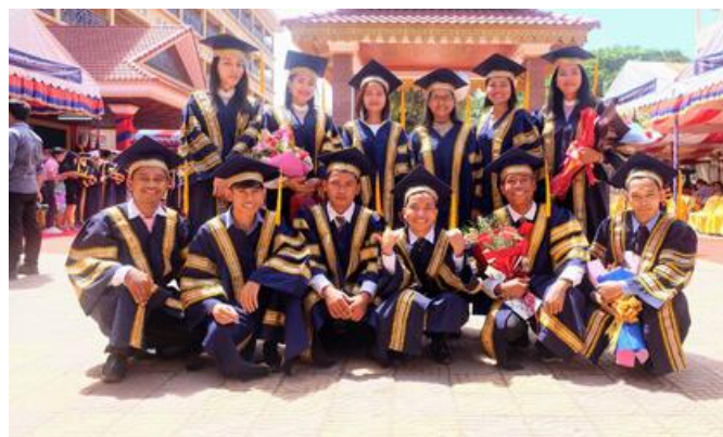
2017-18 Scholarship Program Graduates at their University ceremony in October